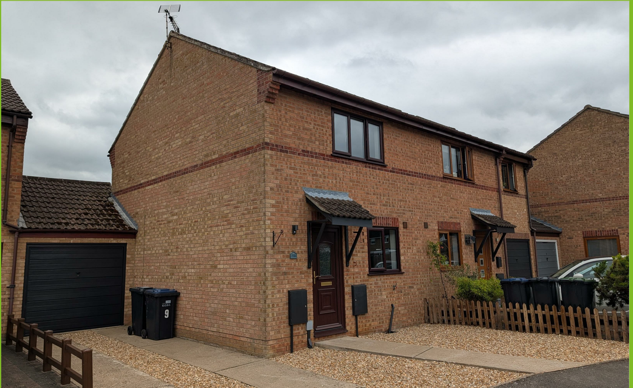
9 Law Close, Littleport, Cambridgeshire, CB6 1TS